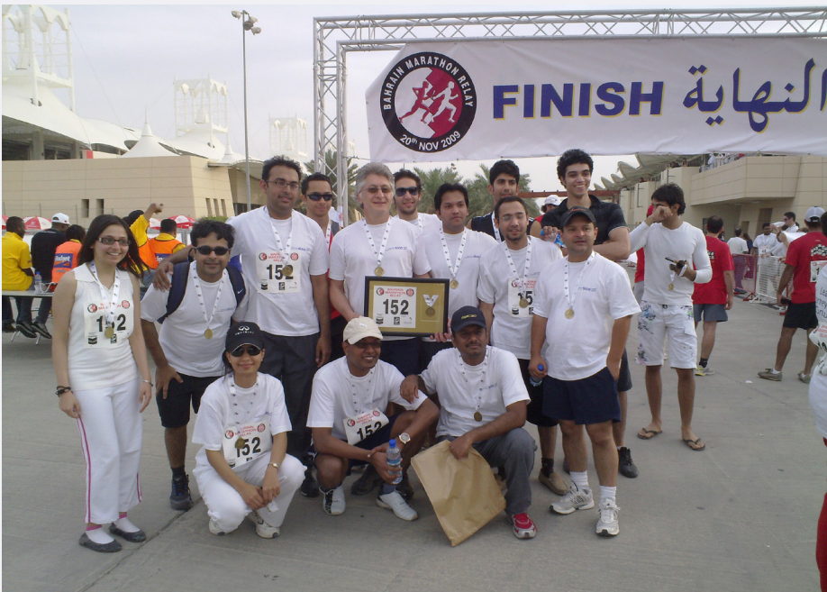
Above: The SICO Team participated in the Bahrain Marathon Relay 2009